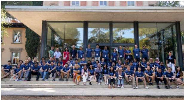
4th ACM Summer School (Barcelona)