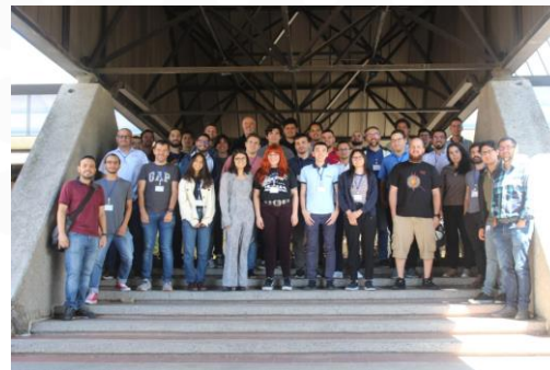
7 th CRHPC School (Costa Rica)