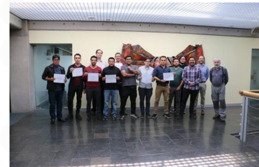
1 st HPC sysadmins school (Santiago de Chile)